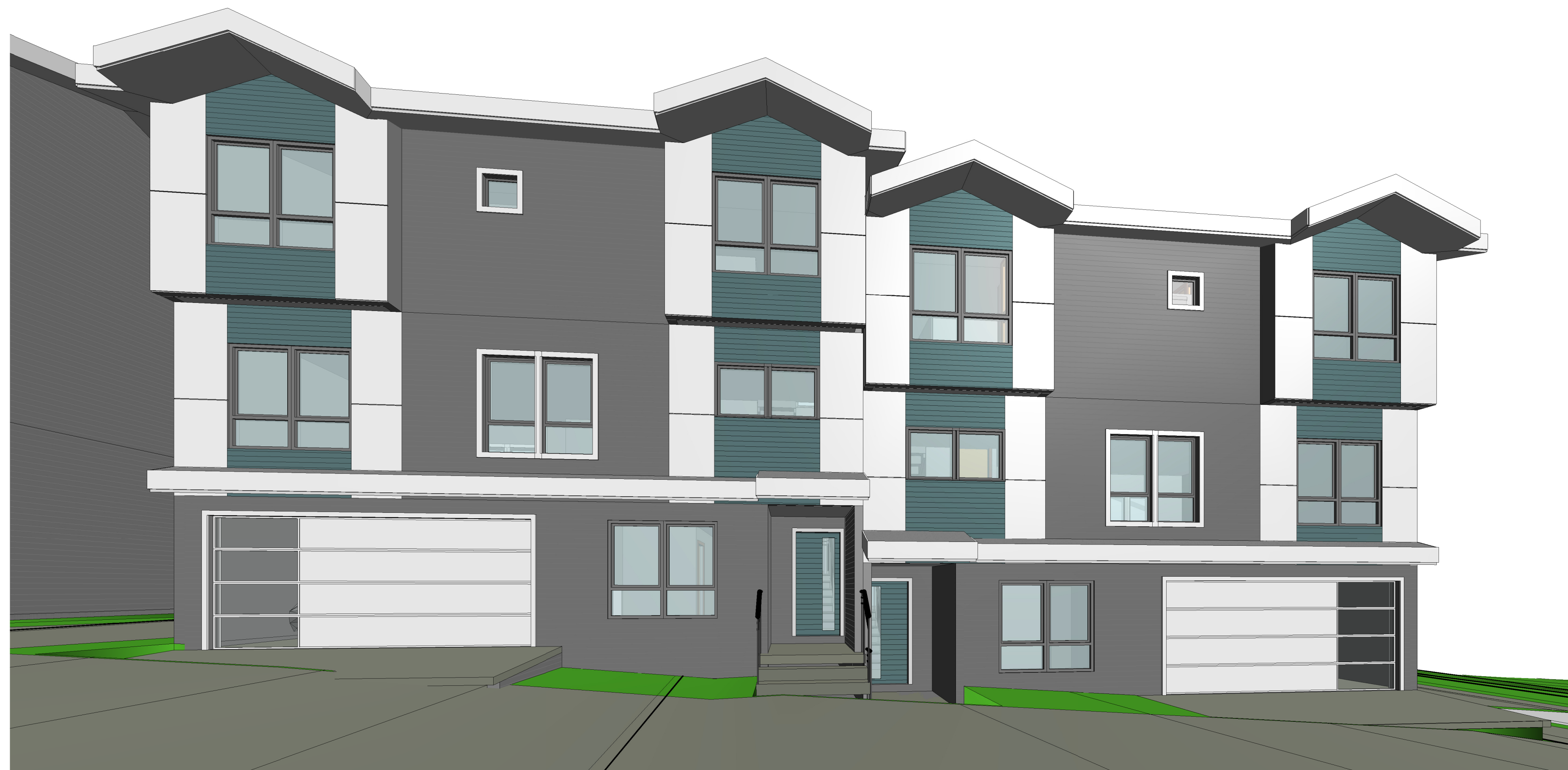
① Typical Exterior Perspective - Duplex