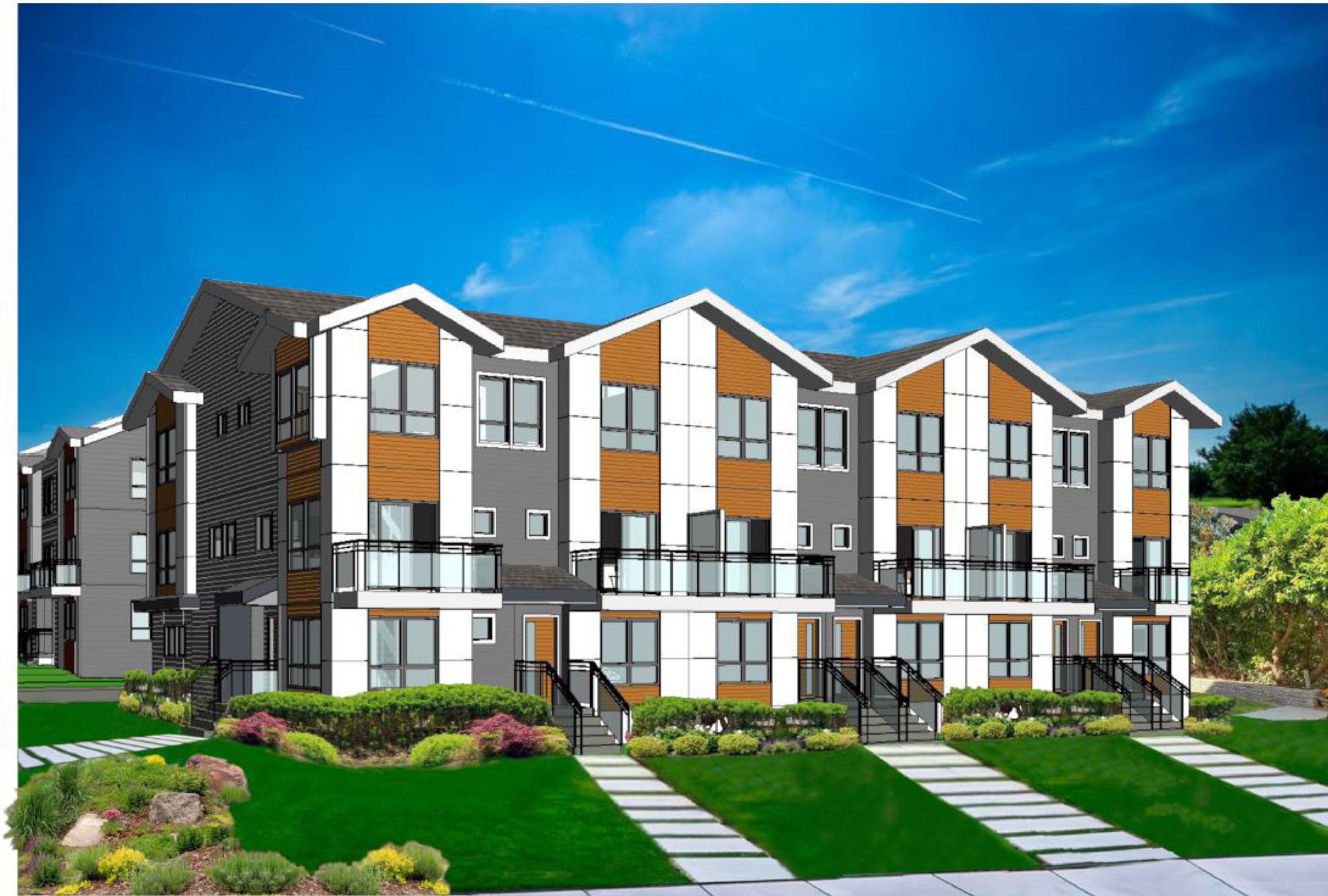
Exterior Perspective @ Labieux Road